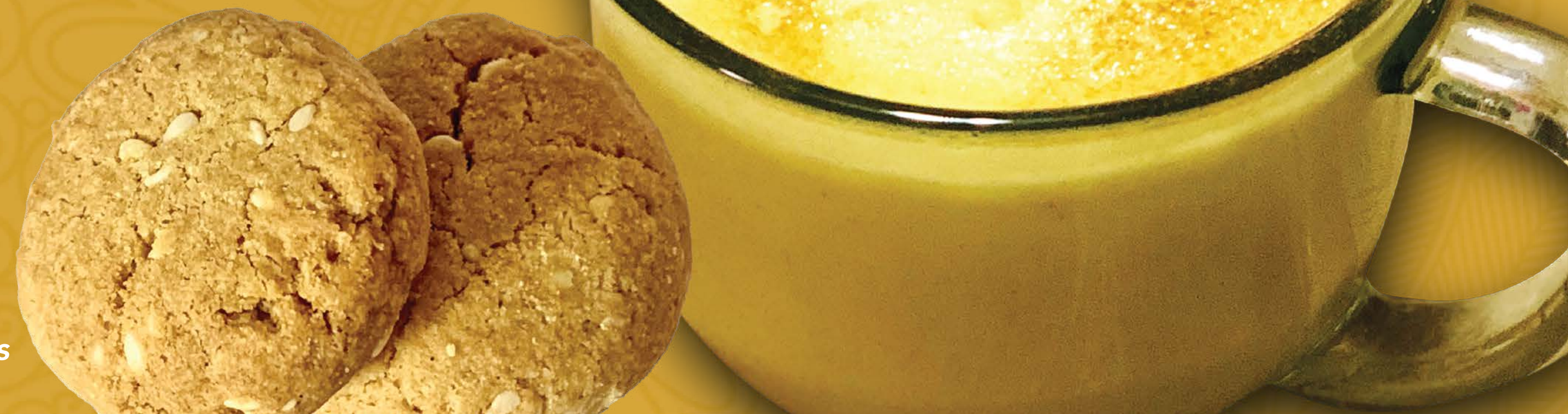
Golden Vanilla Sesame Cookies